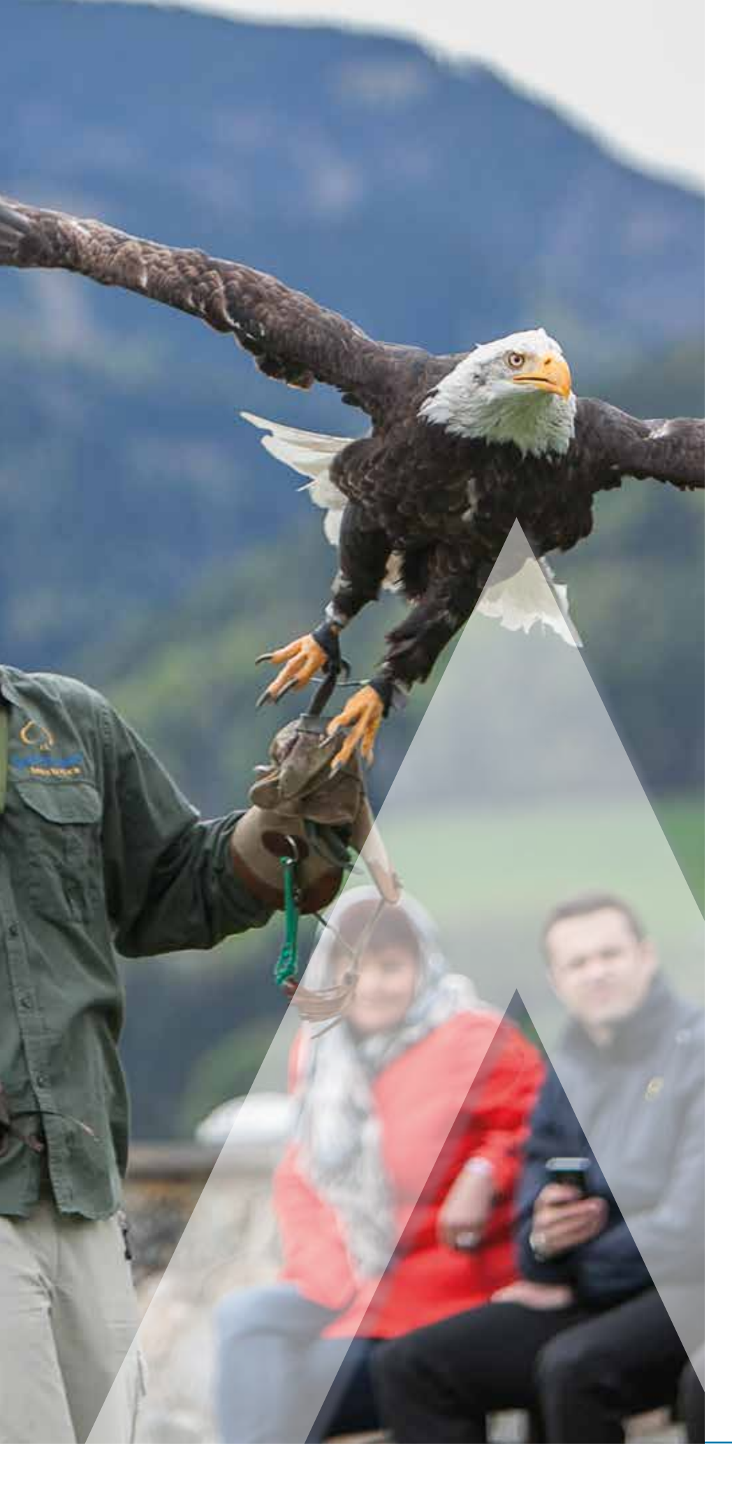
voestalpine BÖHLER's surroundings guarantee unique experiences for all senses.